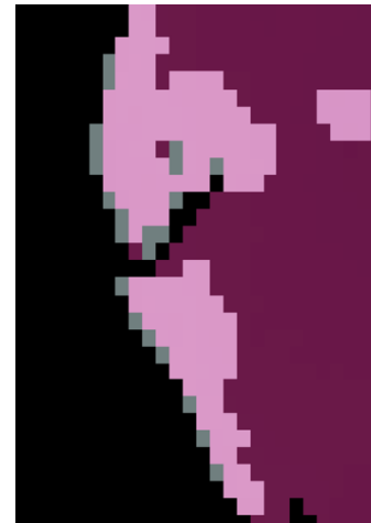
Figure 3 Coastal CHIRTSmax pixels overlaid with GHS-UCDB data near Tampa, FL. Black pixels are ocean, light pink are urban areas, dark pink are rural areas, and gray pixels are urban areas that overlap with ocean CHIRTSmax pixels.

Given rapid urbanization across Africa, accurate and fine-scale measurement of urban populations is key to understanding how urban areas will respond to climate change. While gridded population datasets do have limitations, they offer the best available data to identify and map urban populations. OpenStreetMap data can assist with this endeavor. Such integrated geospatial approaches are required to advance our understanding of complex, human-natural systems if we are going to develop sustainable solutions for the myriad of problems climate changes poses for Africa's urban population.